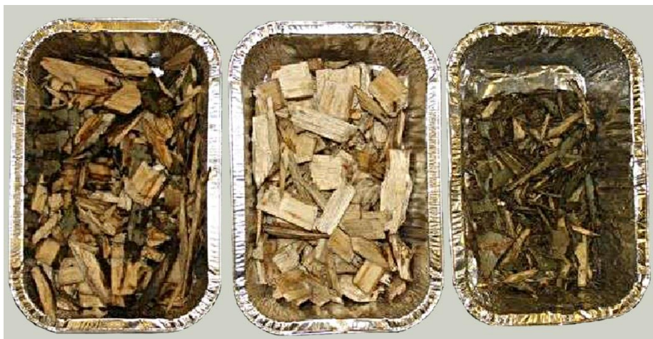
Picture 1: Energy chips and its components: juvenile wood and juvenile bark of Salix viminalis clone Inger grown on plantation

A view of the sample of energy chips and individual components of the bio-fuel: wood and bark in the sample of Salix viminalis clone Inger is in the pic.1.