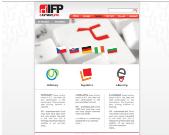
Fig. 1. Web page of the portal