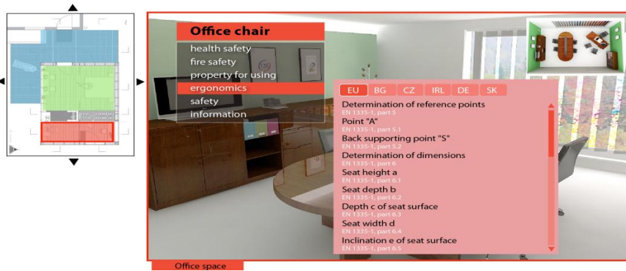
Fig. 3. Virtual house office space with ergonomics information

E-learning module created in five language versions reflecting a composition of the consortium (English, Czech, Slovak, German and Bulgarian). This fact helps to improve next to vocational education also language education of all target groups.