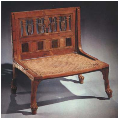
Figure 1: A boxwood and ebony chair with a seat of linen cord. About 1490 B.C.

beds, chairs (Fig. 1), and stools were to be found in well-equipped homes. Wickerwork stands (Fig. 3) were more usual than wooden tables, and chests and baskets took the place of cupboards and drawers. Mats of woven rushes covered the floors.” (Scott, 1973). Howard Carter, the discoverer of Tutankhamun’s Tomb, describes in his archives many objects made of wicker, such as baskets (Fig. 2), sandals, trays (Fig. 3), chests, etc.