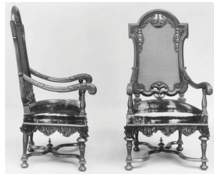
Figure 8: Pair of armchairs, caned backrest, ca. 1689-1702, The Metropolitan Museum of Art