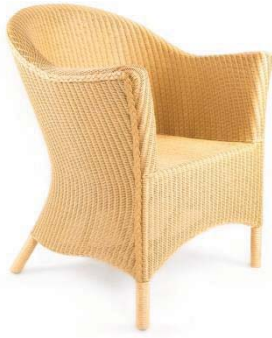
„Classical Roman Type”: Poplar Chair, by Lloyd-loom, UK.