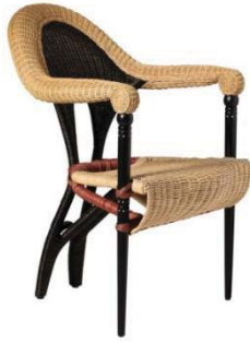
Figure 17: Borek Sipek, Liba chair for Driade, 1980–1989