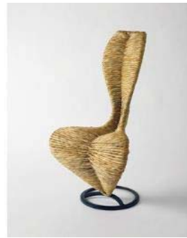
Figure 14: S Chair, Tom Dixon, 1987 (structure), 1993 (upholstery). Victoria and Albert Museum, London

rattan material is used in two basic trends: as a structural, form-building strong skeleton, allowing the soft organic look the plant itself is suggestive of. On the other hand, rattan is treated as a flexible ‘skin’ material giving a unique character to otherwise cold and geometric material, such as steel tubing or wood. Contemporary designers were always tempted by its airy, lightweight look, starting from the design classic of cantilever chairs by Breuer (Fig. 15) and Mies Van der Rohe (Fig. 16), and ending to the sculptural work by designers such as Tom Dixon with his famous S-Chair from 1987 (Fig. 14).