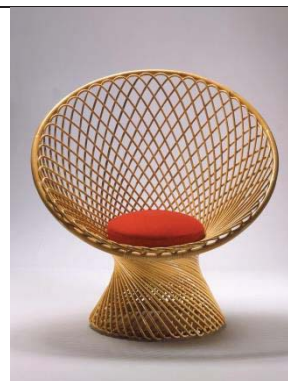
„Flower-Basket Type”: Primavera armchair by Franca Helg, 2001, manuf. Bonacina 1989