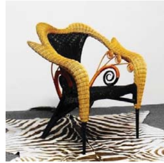
Figure 18: Borek Sipek, Liba Lounge Chair for Driade; 1980–1989