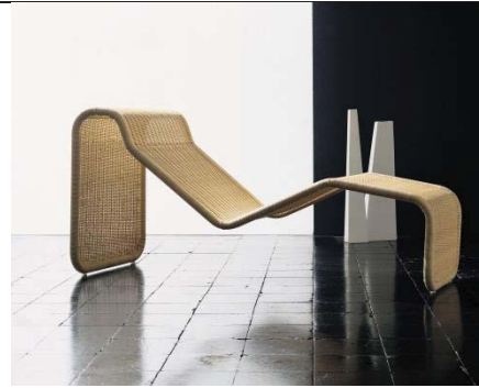
„Flying Carpet Type”: Tito Agnolli’s B35 Chaise Long for Bonacina is a single caned frame, bent in space