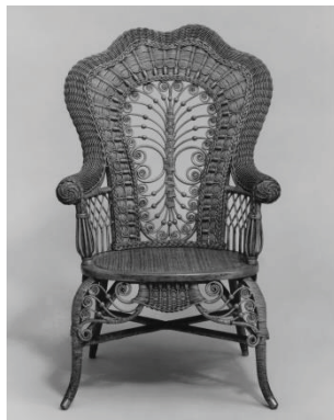
Figure 7: Heywood Brothers and Wakefield Company 1897-1910, Metropolitan Museum of Art