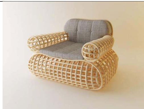
“Mesh Type” rattan furniture: the structure is visible, the effect is light and airy