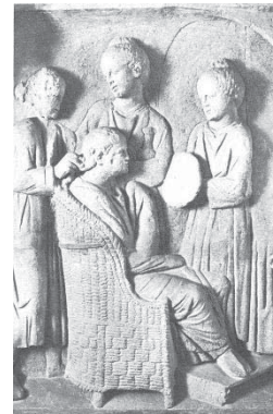
Figure 4: Stone relief showing a woman, seated on a wicker chair with high rounded back. Early 3 rd century AD. Trier Museum