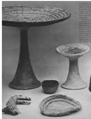
Figure 3: Ancient Egyptian wickerwork tray on a stand, a whisk, a strainer, a bowl used as a lamp, and a brazier