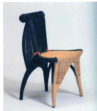
Figure 20: Borek Sipek, Helena Chair, 1991

Manufacturer: Vitra, Material: Steel, basketwork, Leather