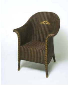
Figure 13: Armchair - Model 464, 1930, W. Lusty & Sons, London. Victoria and Albert Museum, London

20 th century designers were always tempted by the potential of the rattan techniques. Their interest concerned texture and the sculptural quality of rattan, as well as the natural atmosphere, the ecologic aspect. The