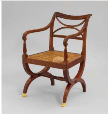
Figure 9: Armchair, attributed to Duncan Phyfe, 1791-1818, New York, USA. Metropolitan Museum of Art