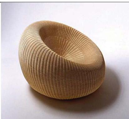
A Closed “Spherical Type”: Armchair Palla, by Giovanni Travasa, manuf. Bonacina 1989