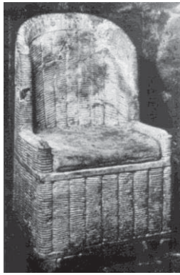
Figure 5: Germano-Roman limestone imitation of a wicker chair. Romisch-Germanisches Museum, Cologne