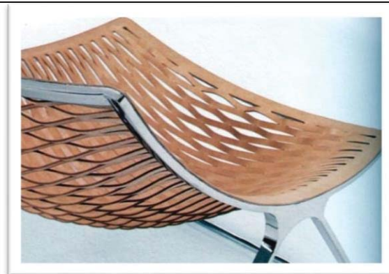
“Imitation Type”: Franco Poli, Armchair Arete, Metal tube structure, lazer cut leather

We can offer a general classification of wicker, by using the following criteria: