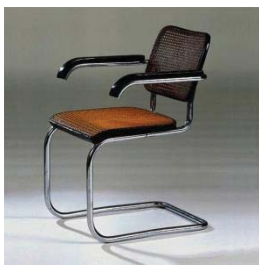
Figure 15: Marcel Breuer, Cesca chair, 1928. Manufacturer Gebrueder Thonet AG; chrome-plated tubular steel, varnished wood, bentwood, wicker