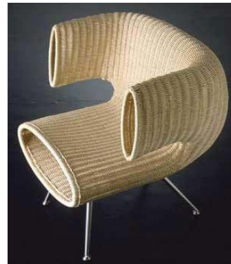
Figure 26 : Contemporary rattan armchair SU SU SU by Kazuhiko Tomita

In fact, rattan (and the varieties of different plants used for wicker) started out as a complementary material, where lightweight or low-cost pieces of furniture were needed. In the 19 th century, its exotic characteristics came to the fore: that is why they are associated with garden furniture, resort hotels. Yet today the household objects and furniture is another field of application, due to the individual and memorable furniture pieces created by using wicker (to bring rustic and craft connotations) or rattan (to bring airy, light, exotic feel) or other natural or artificial materials.