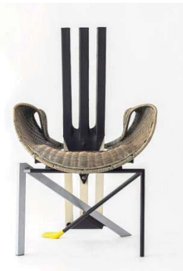
Figure 19: Paolo Deganello, Documenta Chair, 1987

Manufacturer: Vitra, Material: Steel, basketwork, Leather