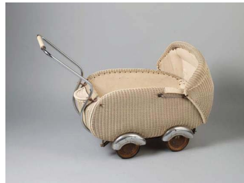
Figure 10: Perambulator, made in Germany, 1930-39, Wickerwork with hardboard. Victoria and Albert Museum