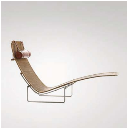
Figure 21: Poul Kjaerholm, PK24 Lounge Chair, Wicker

Rattan is a classical natural material that offers texture and natural color, very much appreciated by designers. Scandinavian authors, such as Poul Kjaerholm (Fig. 21) and Hans Wegner (Fig. 22); Italian designers, such as Tito Agnoli (Fig. 24), Bauhaus designers, such as Marcel Breuer (Fig. 15) etc., all show interest and work with wicker made of rattan or other materials.