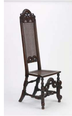
Figure 6: Chair, possibly manufactured in London, ca. 1705-1715. Victoria and Albert Museum, London