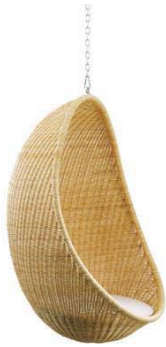
Figure 25: Egg, di Nanna Jørgen Ditzel, manuf. By Pierantonio Bonacina