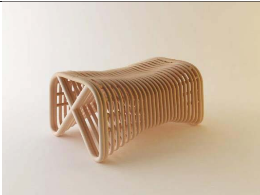
„Linear Structure Type” : the volume is delineated by series of contours close to each other; the structure is a ‘ribbed’ one