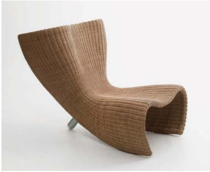
Figure 23: Marc Newson, Idée Lounge chair, Tubular steel, cane, woven rattan