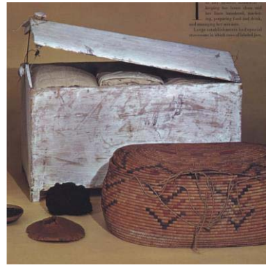
Figure 2: A basket and chest for linen, Ancient Egypt.