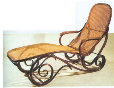
Figure 12: Michael Thonet, chaise long

In Ancient Rome, round wicker arm-chairs were produced (Fig. 4), considered to be originally made by the Etruscans. In the middle Ages and the Renaissance, the technique was very probably used for basket-weaving and other household items. During the Baroque age of the 17 th century, caning began to be made for chair seats and backrests (originally, caning came from the Far East; furniture parts were caned in India and other colonies, to be later transferred as a separate craft – caning – in Europe). In the late 17 th century caned chairs (Fig. 6) became extremely popular not only among the aristocracy and gentry, but also among merchants and tradesmen, as they were much cheaper than upholstered chairs. From the 1680s onwards enormous quantities were made in London, for export as well as for home consumption. But relatively few now survive. Most were probably discarded rather than repaired as soon as the frames or caning were damaged (Collections, Victoria and Albert Museum).