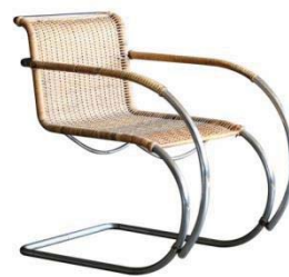
Figure 16: Ludwig Mies van der Rohe, MR20 lounge chair designed for Berliner Metallgewerbe Josef Muller. Circa 1930

sign solutions include a structure of a different material, integrated with elements, made of rattan weave (Fig. 17, Fig. 18).