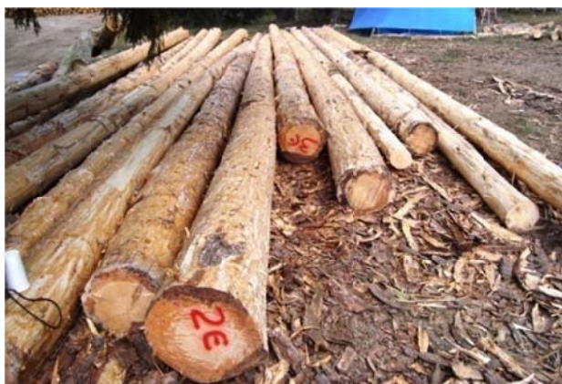
Figure 5: Produced poles that met the requirements of the P.P.C. standard.