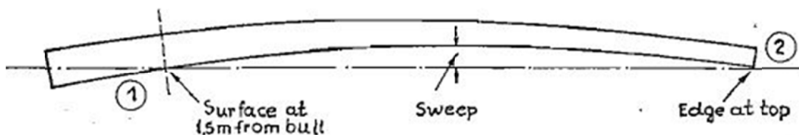
Figure 3: Measurement of sweep in one plane and one direction (GR-49 1981).

Poles shall be straight and free from crooks or localized deviations from straightness which, within any section 2 m or less in length, are more than one-third of the mean diameter of the crooked section. Poles may have a single sweep or curvature in one direction provided that a straight line joining (1) the surface of the pole at a distance of 1,5 m from the butt and (2) the edge of the pole at the top, shall not be distant from the surface of the pole at any point more than 8 mm per meter of length between points (1) and (2) (See Fig. 3).