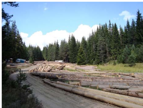
Figure 2: View of the investigated stands at the “Vathyrema” forest region of Drama prefecture.